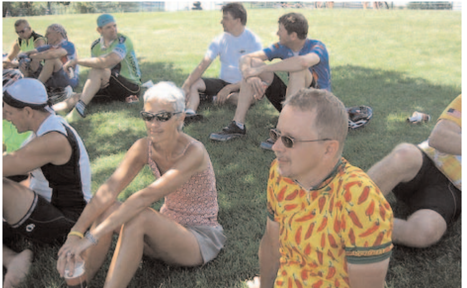
Cyclists relax after the ride during the 2007 FABRAD at Falls Park. This year's FABRAD is scheduled for July 5 beginning and ending at Cherry Rock Park.

to be back at the park between noon and 2 p.m. for a picnic lunch provided by Bob's Carryout and Delivery featuring broasted chicken, pulled pork sandwiches and an assortment of side dishes.